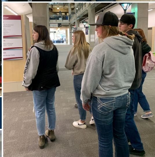
The classes also listened to a presentation from Augustana University located in Camrose.